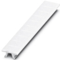
Zack marker strip, 10-section, horizontally labeled with the consecutive numbers: 121 ... 130, white, width: 6 mm

Please be informed that the data shown in this PDF Document is generated from our Online Catalog. Please find the complete data in the user's documentation. Our General Terms of Use for Downloads are valid ( http://phoenixcontact.com/download )